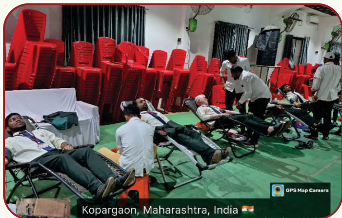
Kopergaon, Maharashtra, India