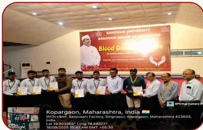
Kopergaon, Maharashtra, India

Wf3v+9mf, Sanjivani Factory, Singnapur, Kopergaon, Maharashtra 423603, India Lat 19.903366° Long 74.49377° 18/09/2025 10:47 AM GMT +05:30