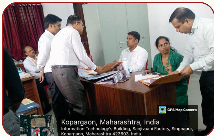
Kopergaon, Maharashtra, India Information Technology's Building, Sanjivani Factory, Singnapur, Kopergaon, Maharashtra 423603, India