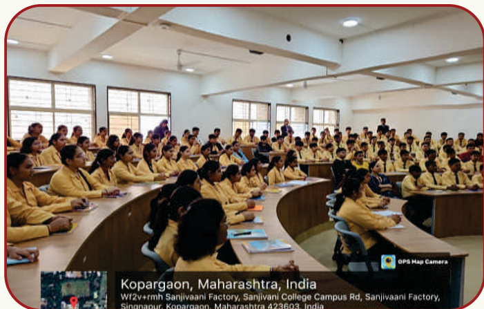
Kopergaon, Maharashtra, India

Wf2v+rmh Sanjivani Factory, Sanjivani College Campus Rd, Sanjivani Factory, Singnapur, Kopergaon, Maharashtra 423603, India